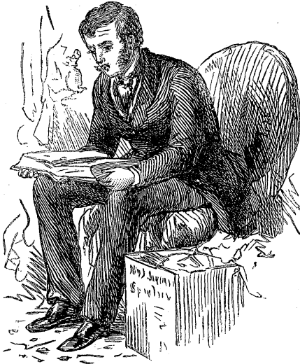
"He found the date of the birth of 'Lillie Ellis.'"

But John, who was curious in the matter of books, sat quietly down in a corner to examine it; and on the middle page, under the head "Family Record," he found, in a large, bold hand, the date of the birth of "Lillie Ellis" in figures of the most uncompromising